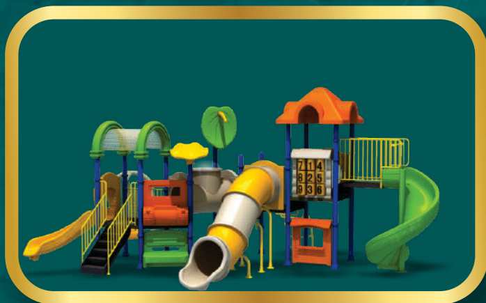
KIDS MULTI PLAY STATION