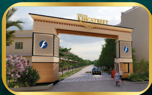
Forteasia Kingstreet, Sector – 3B Bahadurgarh