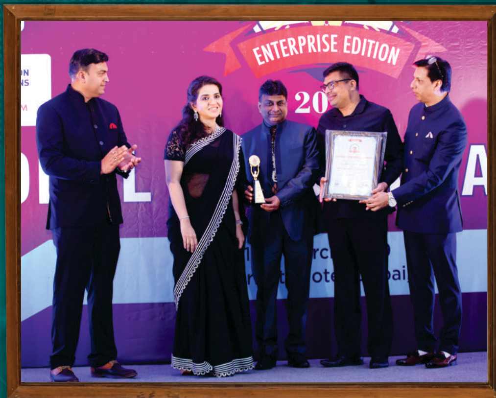
Best Emerging Township award to Forteasia Residency, Sector 28, Bahadurgarh at Global Entrepreneurship Awards, 2018.