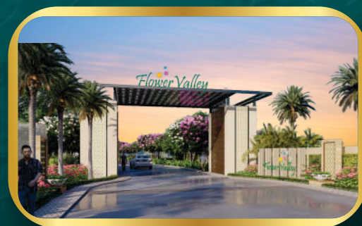
Forteasia Flower Valley, Sector -25 Yamuna Nagar