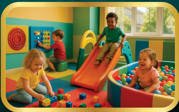
KIDS PLAY AREA / TOT LOT