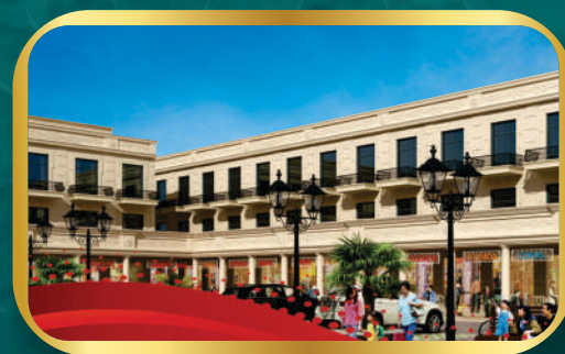
Forteasia Mart, Sector – 26&28, Rohtak