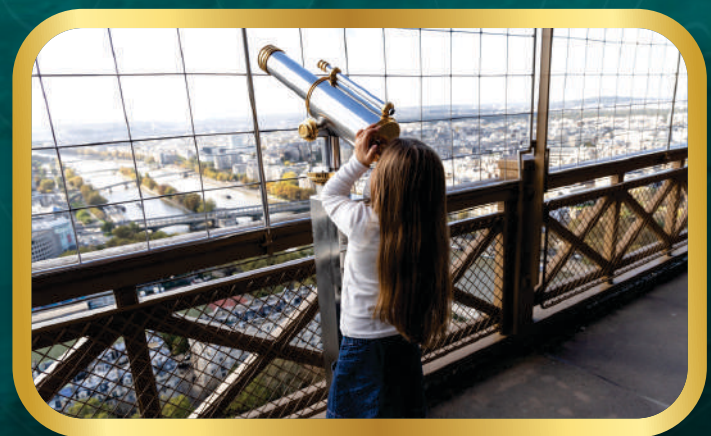
SKY OBSERVATORY DECK