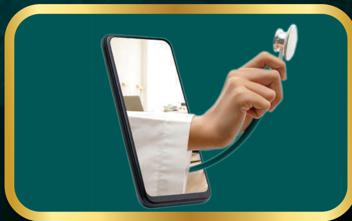
DOCTOR ON CALL