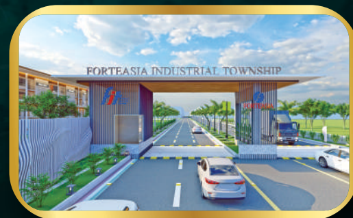
Forteasia Industrial Township (FIT) Kalanaur, Rohtak, Haryana