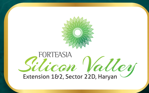
Forteasia Silicon Valley, Extension 1&2, Sector 22D, Haryana