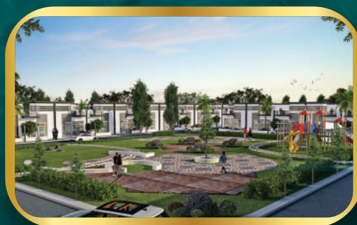
Forteasia Residency, Sector 28 & 28A, Bahadurgarh, Haryana