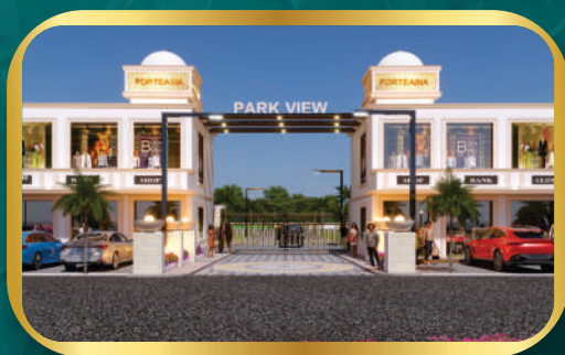
Forteasia Park View, Sector – 27A, Rohtak