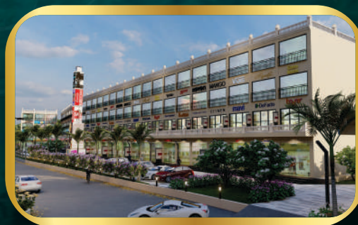
Forteasia Times Square, Sector 3B, Bahadurgarh