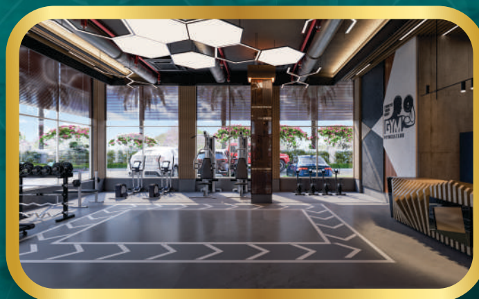
PANORAMIC VIEW GYM