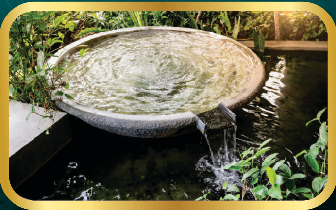
WATER FEATURE WITH SCULPTURES