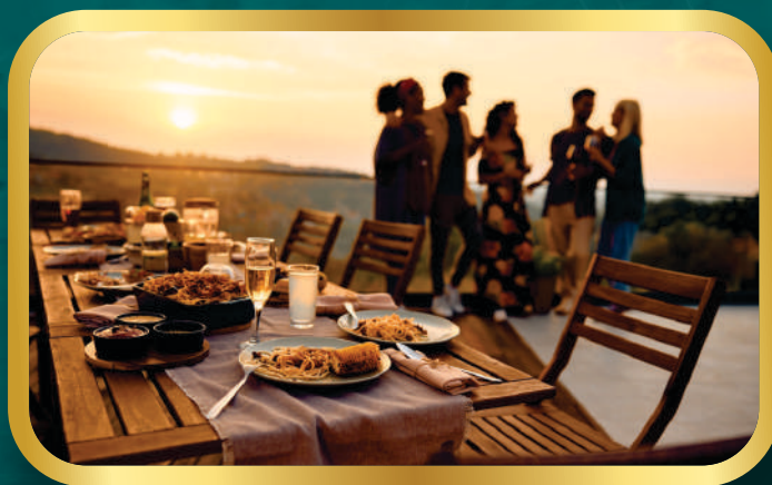
OUTDOOR TERRACE PARTY SPACE