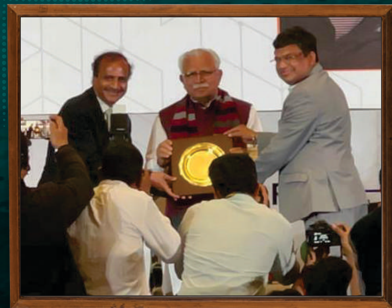
Recognized for on-time delivery of Forteasia Residency, Sector 28, Bahadurgarh project by the Hon'ble Chief Minister. The project was completed in a record time frame of less than a year.