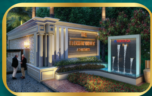
Flower Valley Sector -26, Jind