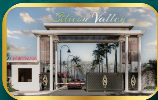
Forteasia Silicon Valley, Extension 3, Sector 22D, Rohtak