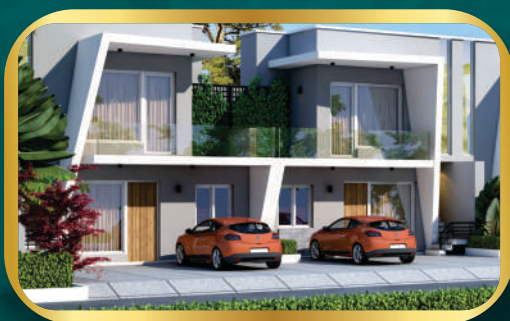
Forteasia The Grand, Sector -35, Bahadurgarh