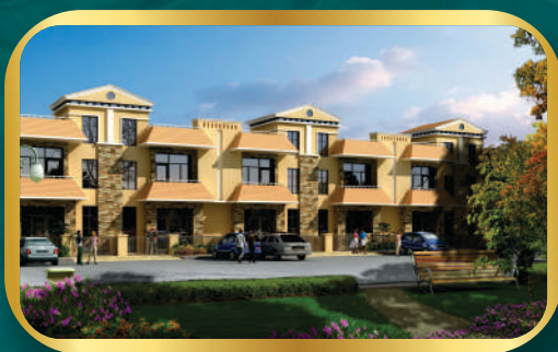
Silicon Valley Sector 22D, Rohtak, Haryana