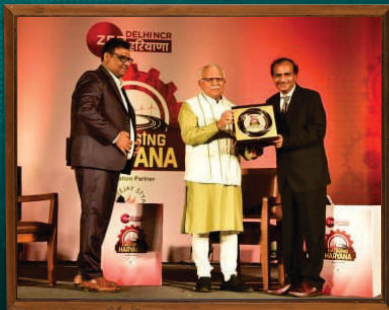
Excellence award to Forteasia Realty Pvt. Ltd. for being an integral part of Emerging Haryana, 2022. Presented by the Hon'ble Chief Minister of Haryana.